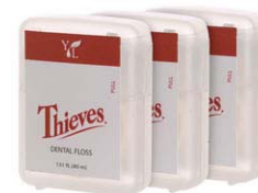
Item No 4464