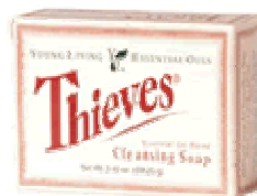
Item No 3679