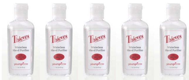
Item No 3621