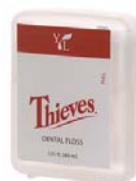
Item No 4463