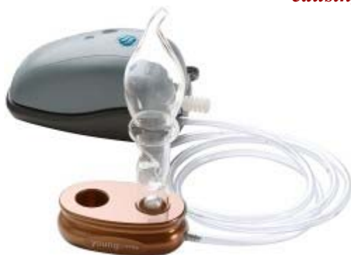
Diffuser Item No 3662

Essential Oils create an unfriendly environment which becomes deadly to disease causing bacteria, viruses and other pathogens.