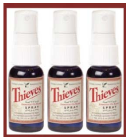
Item No 3266