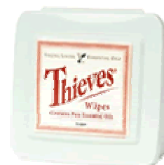
Item No 3756