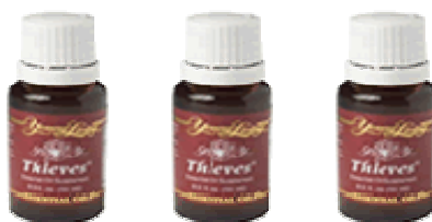
ITEM NO 3423

Thieves® essential oil blend with the Young Living® patented diffusing system creates a safe and simple means of filling your home with therapeutic benefits. Many forms of bacteria and mold spores linked to many common ailments can travel through the air. Diffusing Thieves adds an extra layer of protection by purifying the air while adding an uplifting scent to your home.